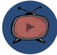
BOOK TRAILER VIDEO