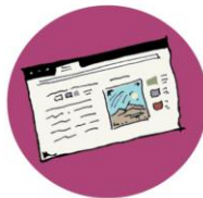
BOOK REVIEW BLOG POST