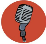
BOOK REVIEW PODCAST