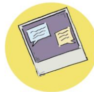
BOOK CLUB WITH STUDY GUIDE